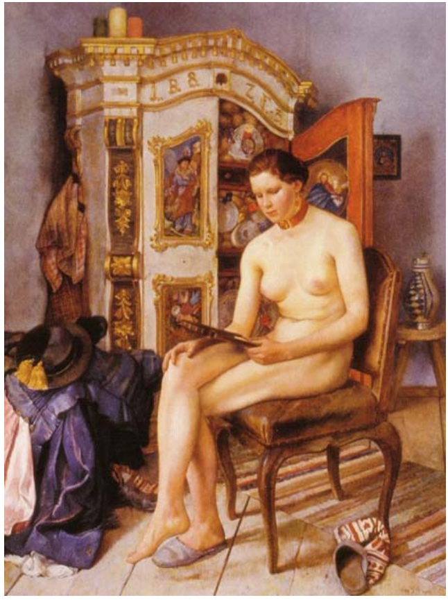
Bäuerliche Venus, 1939