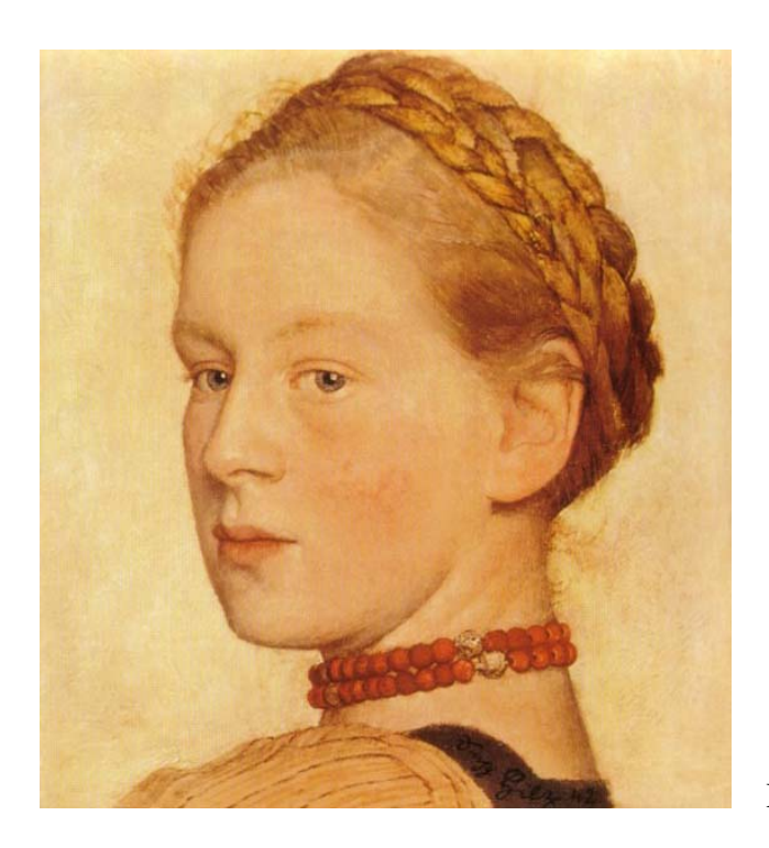
Die rote Halskette, 1942